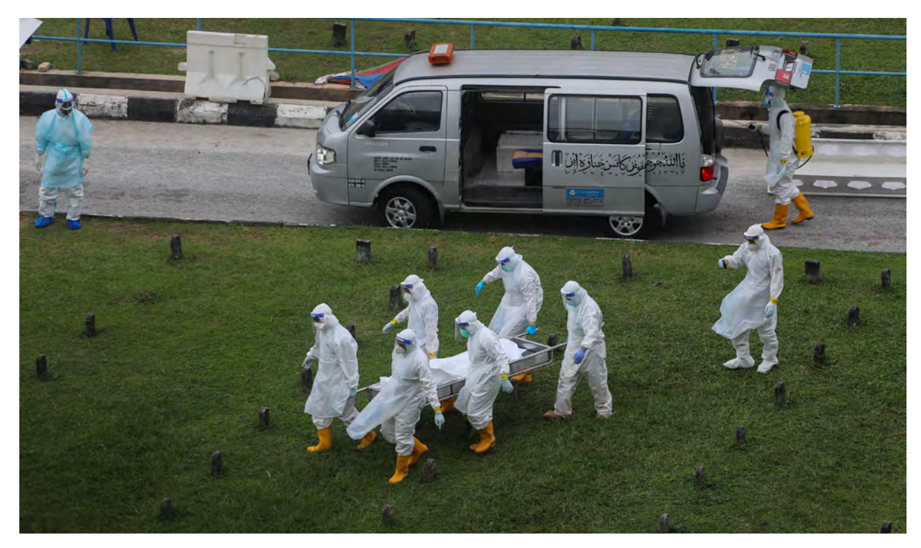
The pandemic has increased the demand for PPE, and has increased the risk of trafficking, forced labour and other forms of exploitation amongst migrant workers.

on the company's compliance. These non-financial audits may focus on different elements of the business, including environmental impacts, corruption or working conditions and labour rights. Assessments which focus on working conditions of the business are referred to as 'labour audits'. Often such audits are conducted by external companies employed by and answering to the business.<sup>54</sup>