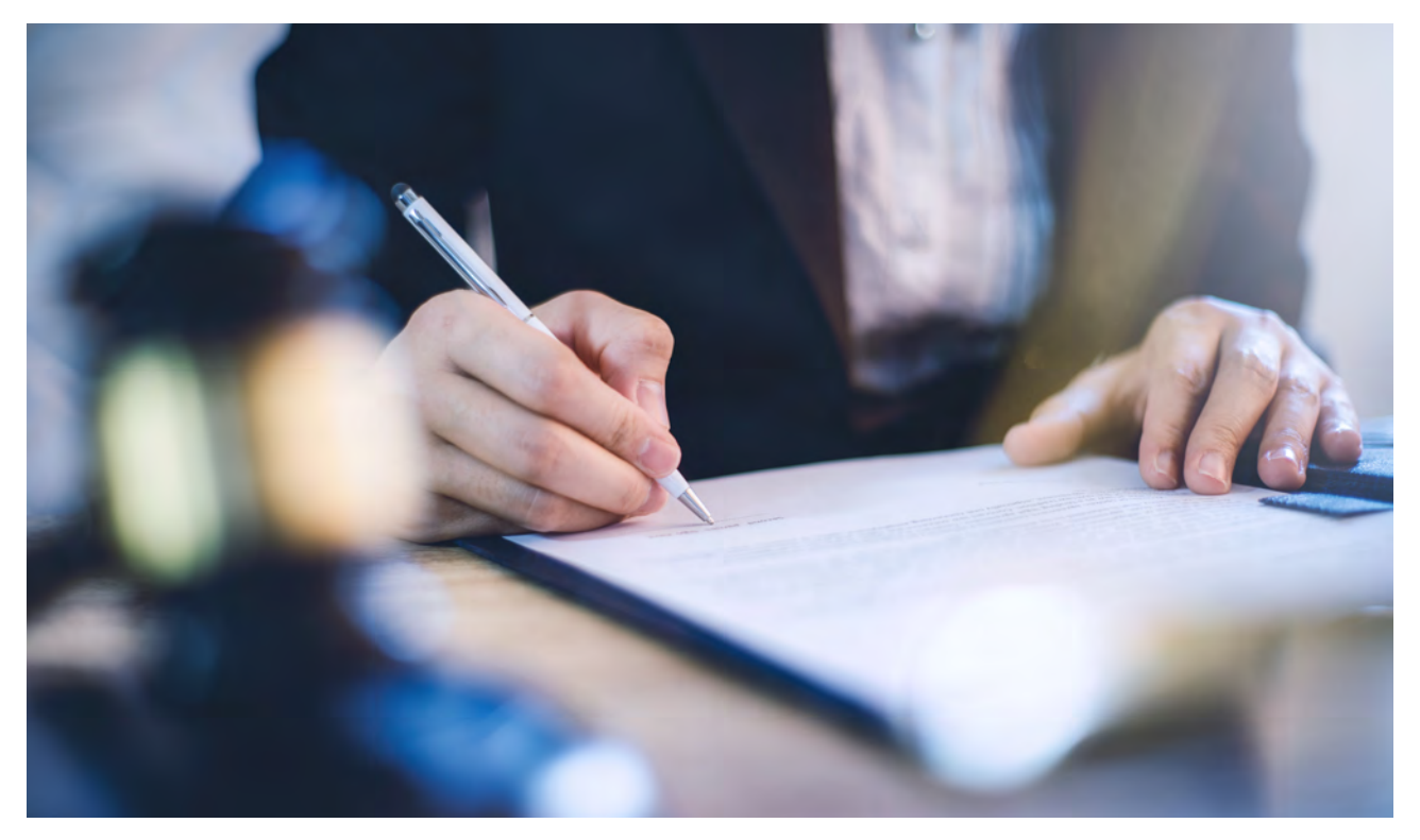
To address trafficking in persons, forced labour, slavery and slavery-like practices in supply chains, States should ratify all relevant international instruments and adopt national legislation.