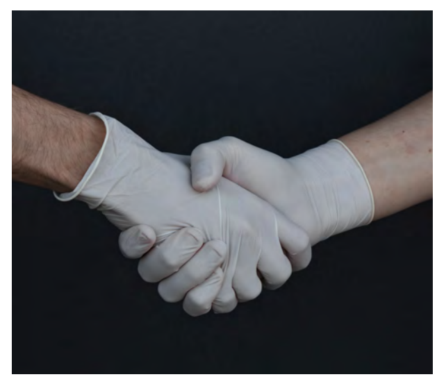
States should conclude bilateral and multilateral agreements that contain mechanisms to ensure international coordination and cooperation.

Since the beginning of the pandemic, the increase in demand for PPE has contributed to an influx of migrant workers from Bangladesh, Myanmar, and Nepal seeking work in Malaysia. <sup>46</sup> Many migrant workers are vulnerable to exploitation, due to their debts to recruitment agencies that assist them in finding employment with manufacturers. <sup>47</sup> Numerous reports have found that measures to regulate the recruitment of migrant workers are crucial to reducing risk factors to trafficking and forced