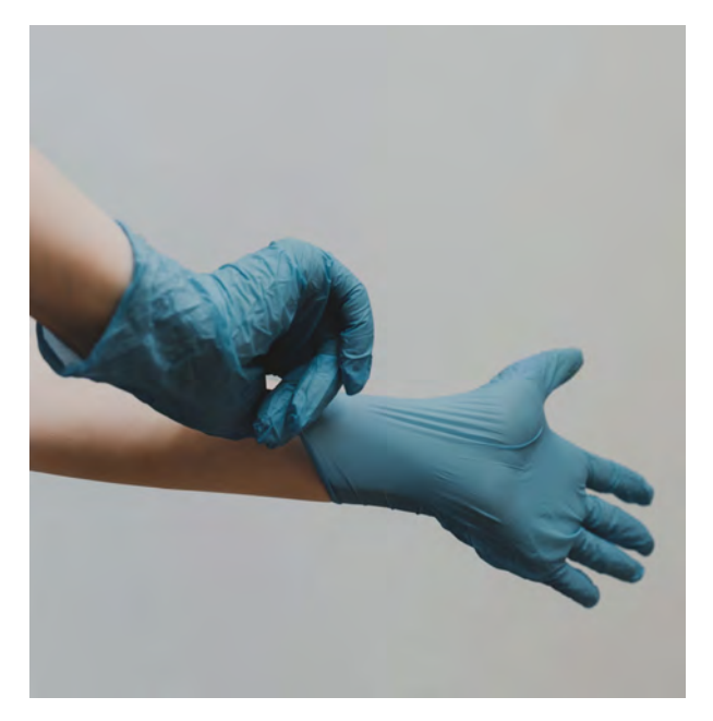
Numerous Australian entities have identified PPE procurement as a high-risk supply chain. Risk mitigation strategies include supplier diversification; increased due diligence, including compliance with human rights and risk of contemporary forms of slavery; and conducting factory visits.

In 2018, Australia, along with Canada, New Zealand, the UK, and the United States, developed a set of principles to tackle contemporary forms of slavery in global supply chains. These principles prescribe that governments should take steps to counter human trafficking in government procurement, whilst also encouraging the private sector to prevent and address human trafficking in supply chains. The principles aim to advance responsible recruitment practices and harmonise relevant laws and policies between the countries. The