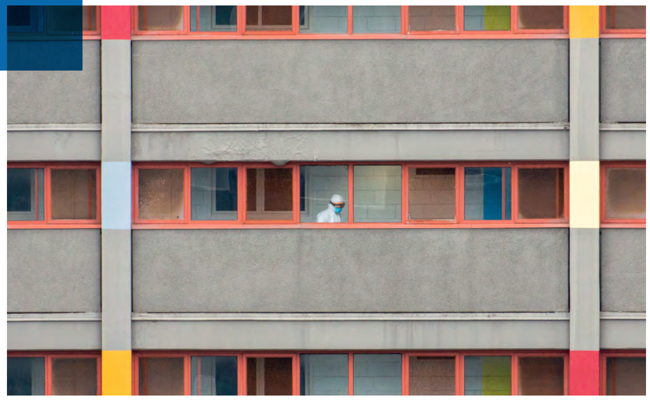
The Australian Modern Slavery Act 2018 requires businesses to identify and address risks of contemporary forms of slavery, and report on their efforts through annual modern slavery statements.

The due diligence principle and need to ensure business accountability have been at the centre of national legislation in a number of countries to ensure more transparency in business activity and their impact on trafficking in persons and forced labour. Under the Australian Modern Slavery Act 2018, businesses and other entities with annual consolidated revenues of at least AUD 100 million (approximately GBP 56.8 million) are required to identify and address risks of contemporary forms of slavery, including forced labour, trafficking and child labour, within their businesses, and report on these through annual 'Modern Slavery Statements' to maintain transparent supply chains. The statements are published on a public register which is open to public inspection for free.