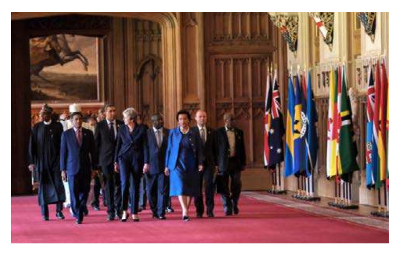
London, United Kingdom, 19 April 2018. Commonwealth leaders congregate during the 25th annual Commonwealth Heads of Government Meeting. The Commonwealth is falling behind on its duty to protect domestic workers: Only 9% of Commonwealth States have both ratified and brought C189 into force.

Of the 35 countries which have ratified the Domestic Workers Convention (C189) worldwide, only 9 are Commonwealth nations.