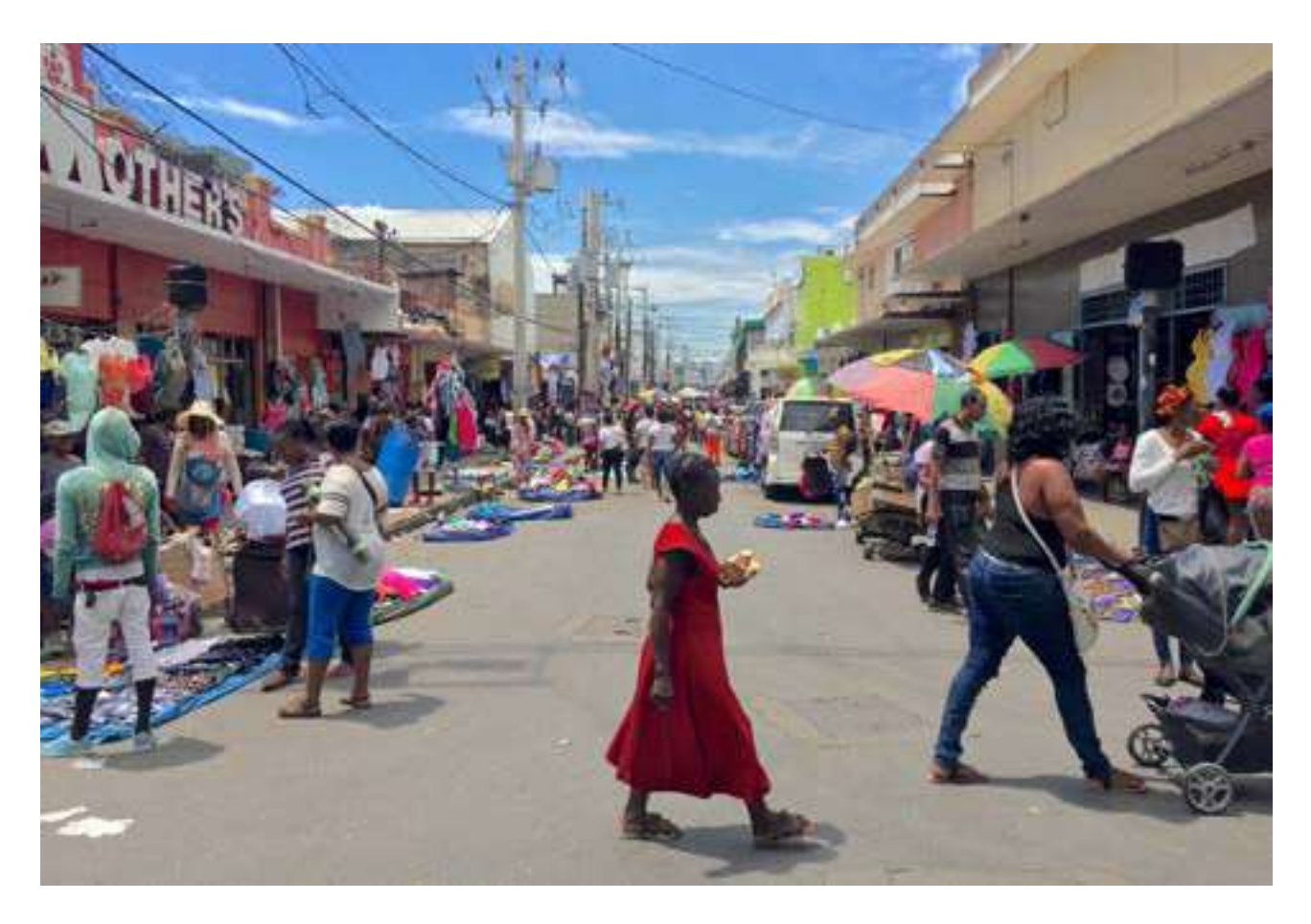
Kingston, Jamaica, March 2017. People walking down the street and shopping during trade days. Ratification of C189 demonstrates Jamaica's wider commitment to promoting decent work for all."

part of the 'Jamaica Formalization Project' which helps informal workers, including domestic workers, to join the formal economy and thereby gain access to protective frameworks, including social security and medical leave. This project comes after 45,000 female domestic workers were not eligible for emergency economic relief programmes during COVID-19.<sup>290</sup> In conjunction with this formalisation effort, the Ministry of Labour and Social Security's Labour Market Information System (LMIS) and JHWU entered into a memorandum of understanding in which LMIS agreed to provide training to the trade union's members.<sup>291</sup> The implementation of this project hinged on this collaboration between government and civil society in order to reach domestic workers throughout the country. This partnership will also establish a JHWU Training Institute to raise the profile of domestic workers and help lift them out of poverty through upskilling and education.<sup>292</sup> The development of the Institute, however, is delayed due to difficulty in obtaining the necessary funding.<sup>293</sup>