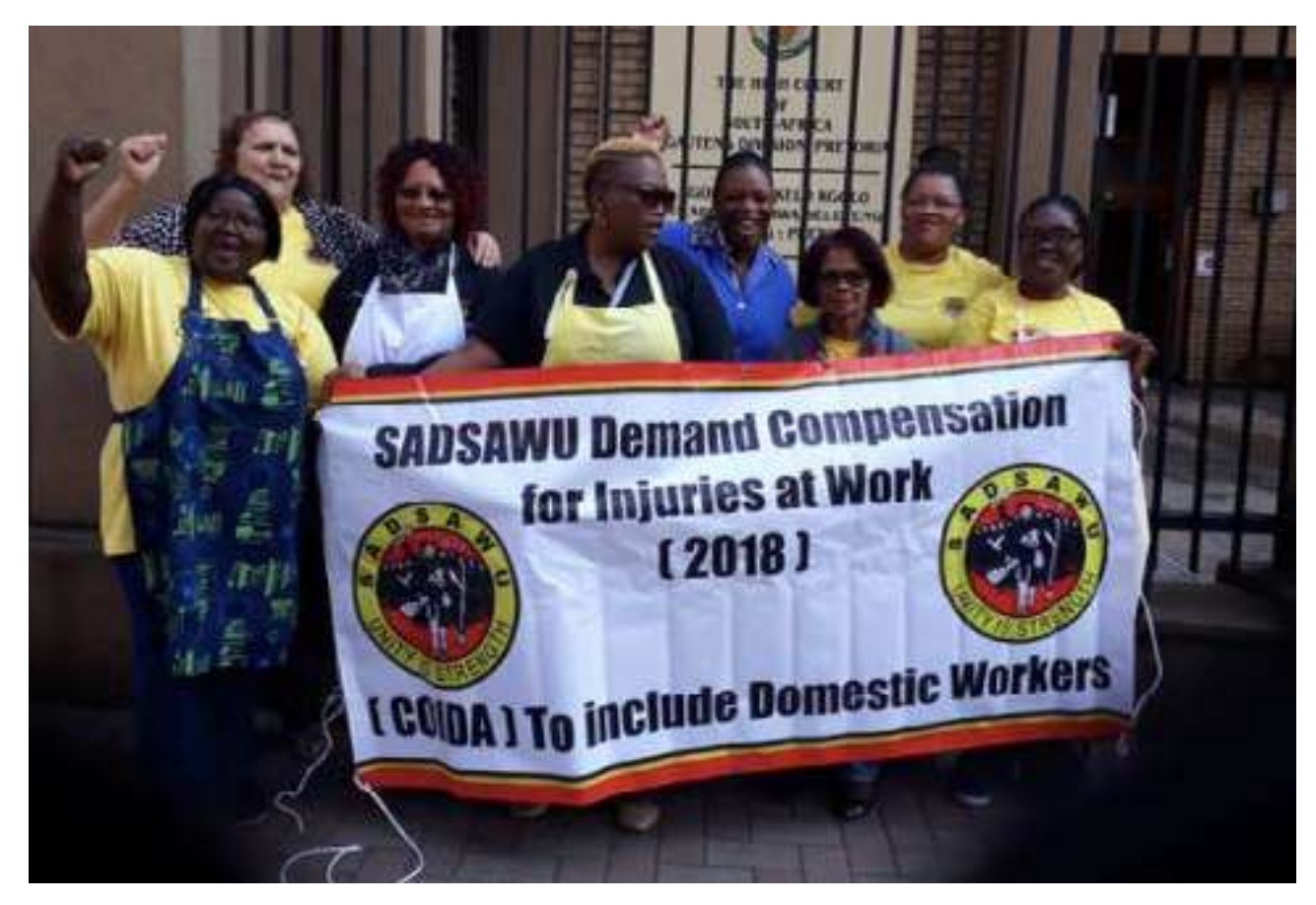
Pretoria, South Africa, 15 October 2018. South African Domestic Service and Allied Workers Union (SADSAWU) leaders protest at the High Court in Pretoria for the inclusion of domestic workers in the Compensation for Occupational Injuries and Diseases Act (COIDA) after travelling 19 hours.

including C189, noting: 'The Domestic Workers Convention recognises the vulnerabilities of domestic workers and Article 3 places a duty on the state to promote and protect them. Article 13 of the Convention further provides that states must ensure the health and occupational safety of workers.'<sup>321</sup> In March 2021, the Compensation Fund Commissioner for COIDA announced that domestic workers would be afforded protection under COIDA.<sup>322</sup> However, the government has yet to elaborate on processes for implementation, including the process for domestic workers to seek compensation.<sup>323</sup> Civil society is hopeful that domestic workers will be able to utilise this new avenue for redress in 2022.<sup>324</sup>