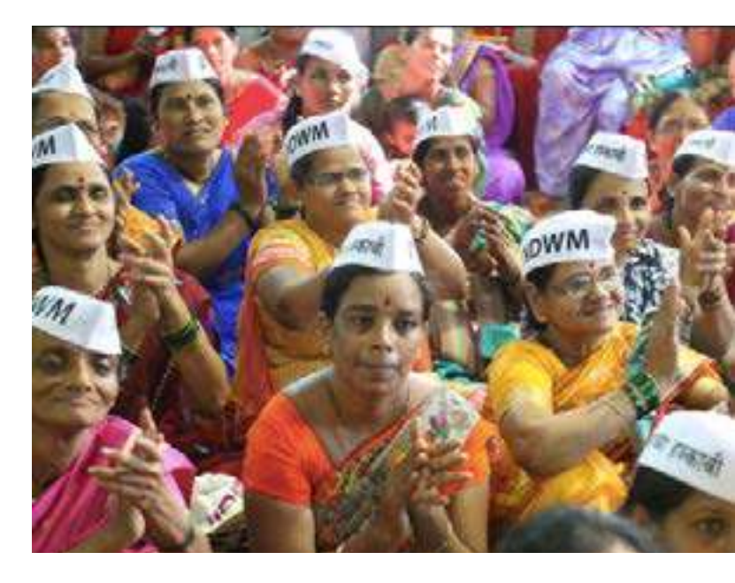
Maharashtra, India, 16 June 2017. A group of domestic workers show their support for implementing a minimum wage for domestic work. The National Domestic Workers Movement (NDWM) in the state of Maharashtra organised a rally and meeting to discuss needed reforms for domestic workers.

As a result of the limited federal attention given to the rights of domestic workers in India, developments are piecemeal and dependent on state priorities. The de-federalised structure of India's worker protections is one of the largest challenges to domestic workers' rights in the country, as it can lead to inequalities for domestic workers across state lines. For instance, of 28 states and union territories in India, only 13 have enacted minimum wages for domestic workers.<sup>199</sup> Under the Unorganised Workers' Social Security Act, 2008, states are required to establish local boards for domestic workers to register for social benefits.<sup>200</sup> However, due to lack of oversight, access to benefits often differs between states, and only some states have set up welfare boards for unorganised workers.<sup>201</sup>