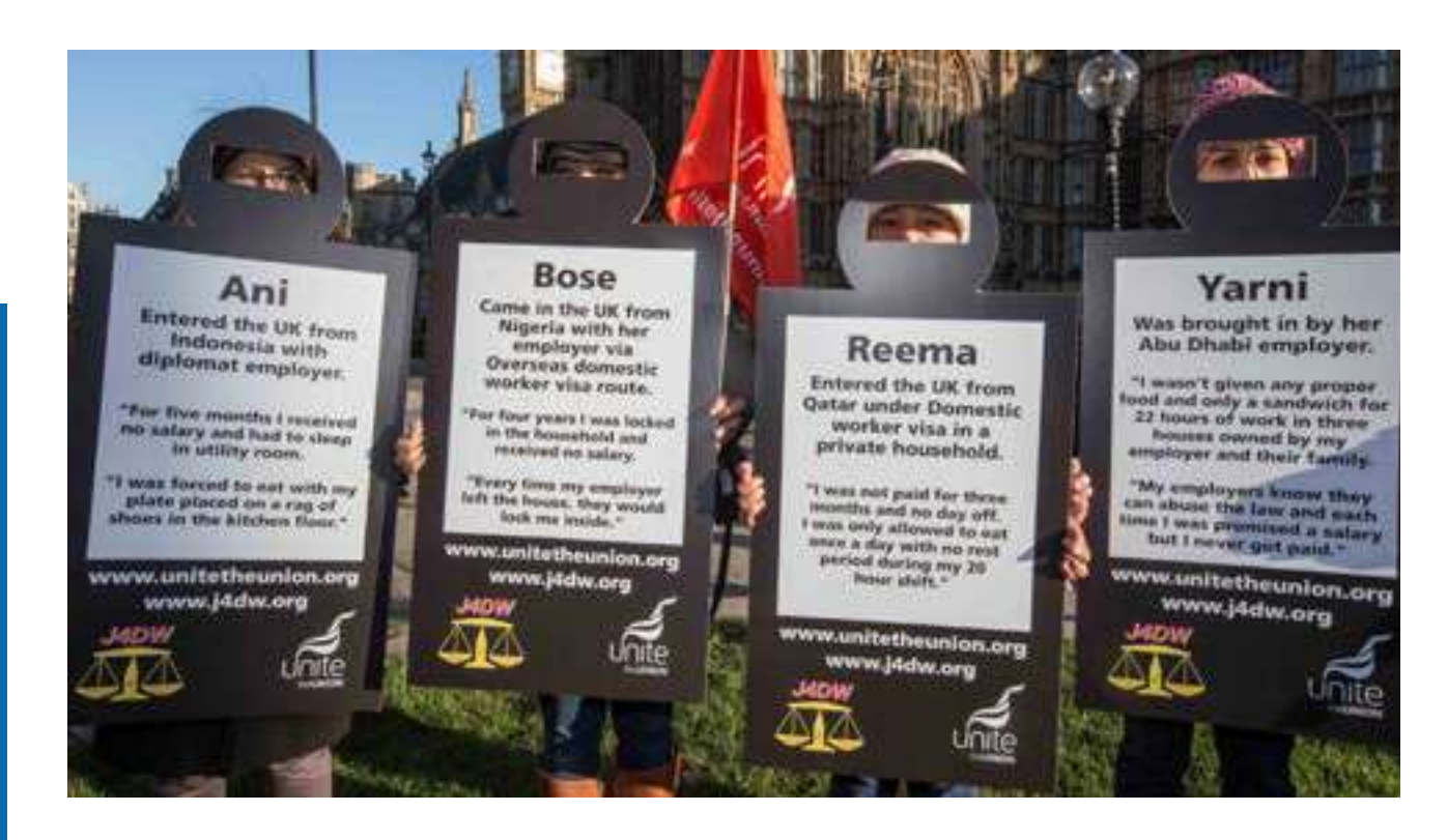
London, United Kingdom, date unknown. Members of The Voice of Domestic Workers (formerly known as Justice For Domestic Workers) hold signs describing stories of migrant domestic workers in the UK.

The current gap in minimum wage coverage has led to a legal challenge against the government and accusations of discrimination against women. Data from 2018 shows that approximately 70% of domestic workers in the UK are women.<sup>111</sup> The UK Employment Tribunal found that an exemption in the National Minimum Wage Regulations for live-in domestic workers was indirectly discriminatory as domestic workers are generally women.<sup>112</sup> In March 2021, the UK government requested the Low Pay Commission to review the exemption