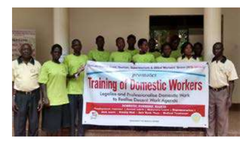
Kampala, Uganda, 13 August 2016. Domestic workers in the Uganda Hotels, Food, Tourism, Supermarkets and Allied Workers Union (HTS-Union) hold a banner for a training. Participants were trained on union organisation, recruitment of domestic workers, strengthening communications between members and the union, as well as on the rights of domestic workers.

In recent years, the Ugandan government has taken steps to protect its citizens working abroad from exploitation and unfair treatment. In 2015, Uganda signed a five-year bilateral agreement intended to promote the recruitment of 1 million Ugandan domestic workers to Saudi Arabia.<sup>142</sup> The agreement prescribed a minimum wage, prohibited salary deductions and placed employee