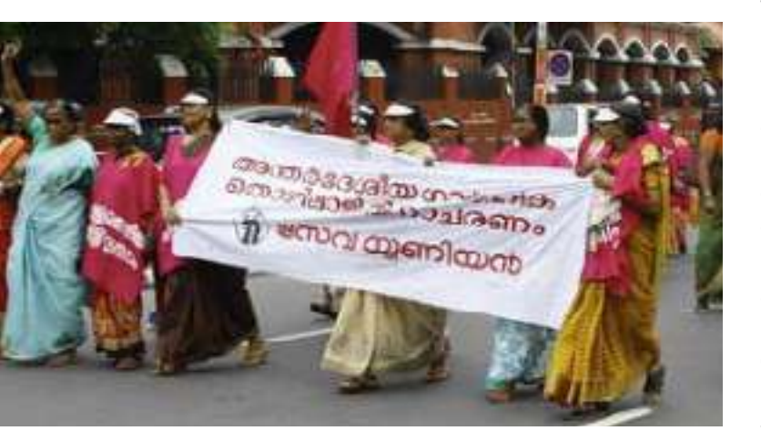
Kerala, India, 18 June 2018. Domestic workers led by the Self Employed Women's Associate (SEWA) Union in Kerala march the streets during Domestic Workers Day in June 2018. Organisers have been integral in pushing reforms in India.

A 2006 study of 500 child domestic workers in West Bengal found that 68% had faced physical abuse, with most of the abuse leading to sustained injuries. A third of these child domestic workers reported having their genitals touched by