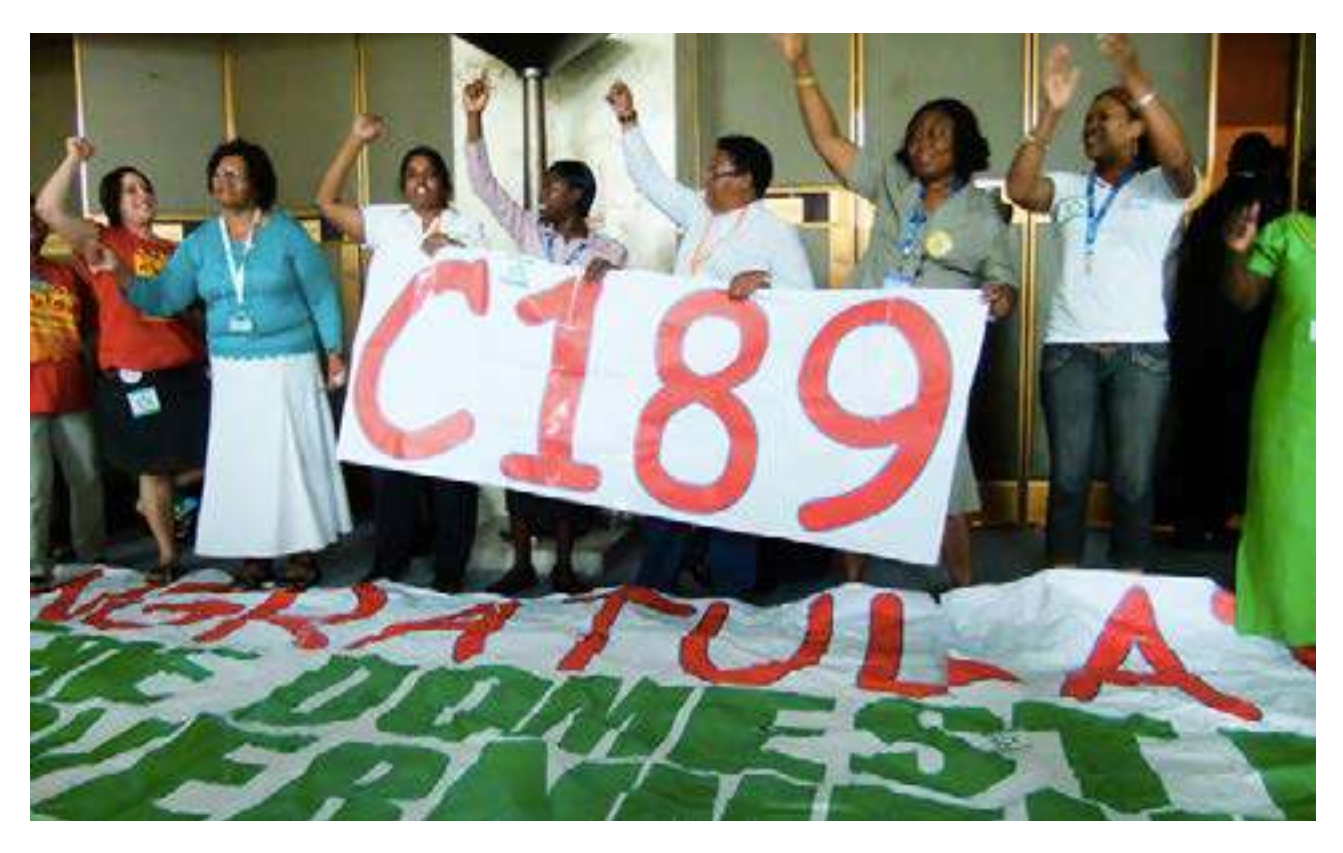
Geneva, Switzerland, 16 June 2011. Domestic workers celebrate the adoption of the Domestic Workers Convention (C189) at the 100th session of the International Labour Conference.

15 years and over, 76.2% of whom are women.<sup>16</sup> Domestic workers typically work long hours for very low wages and are often excluded from labour and social protections.<sup>17</sup> Where protections and enumerated rights do exist in national legislation, there is a high risk of non-compliance due to the informal<sup>18</sup> nature of the work and the lack of collective organisation or union membership.<sup>19</sup> The risk of abuse is even higher for migrant domestic workers, who have limited freedom to change employers and are often dependent on recruitment agencies and stringent visa terms.<sup>20</sup>