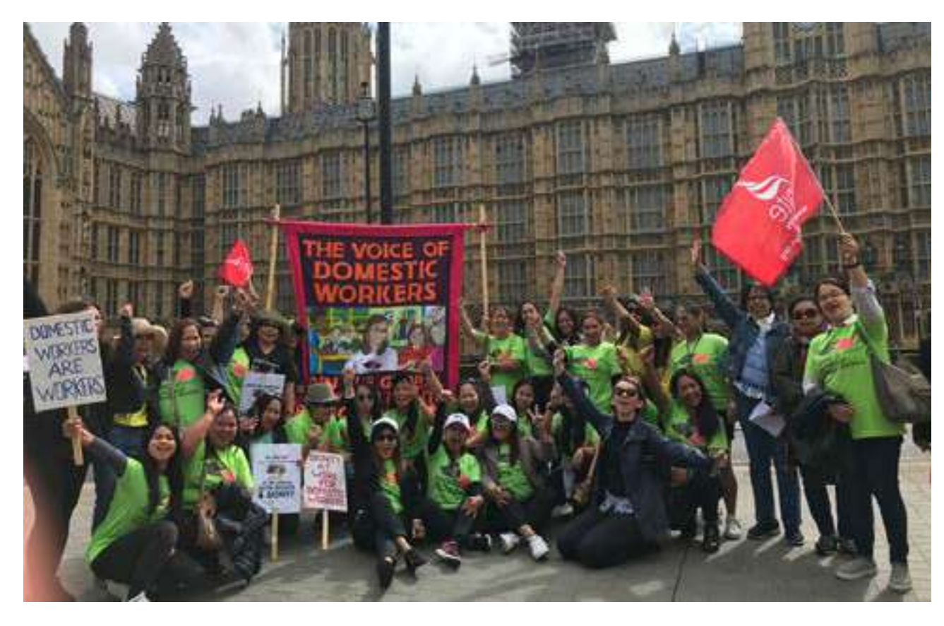
London, United Kingdom, date unknown. Members of The Voice of Domestic Workers (formerly known as Justice For Domestic Workers) display signs and banners in support of domestic workers in front of Parliament.

government requested an independent review of the Overseas Domestic Worker visa in 2015. The review found that not being allowed to change employers or apply for extensions is 'incompatible with the reasonable protection of overseas domestic workers while in the UK'.<sup>86</sup> It recommended that migrant domestic workers be given the right to change employers, and be allowed to apply for extensions to their visa for at least 2.5 years.<sup>87</sup> The review also proposed mandatory 'group meetings' to provide migrant domestic workers with support and information about their rights while working in the UK.<sup>88</sup>