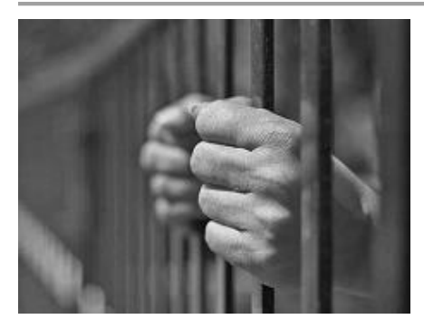
Kerala Prison to Have Exclusive Third Gender Block