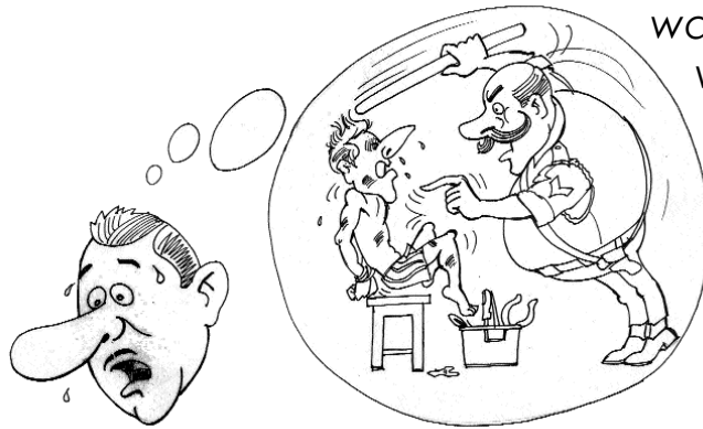
A POLICE OFFICER CAN BE PUNISHED FOR USING FORCE DURING INTERROGATION