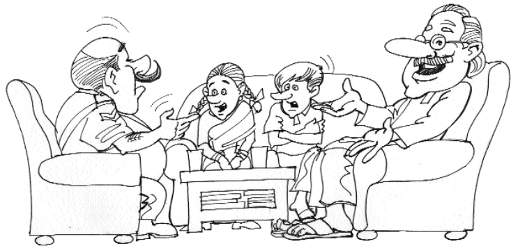
A WOMAN AND A CHILD MUST BE INTERROGATED AT THEIR HOME IN THE PRESENCE OF RELATIVES

"A woman can't be made to go to the police station for interrogation. She can be interrogated only at her residence in