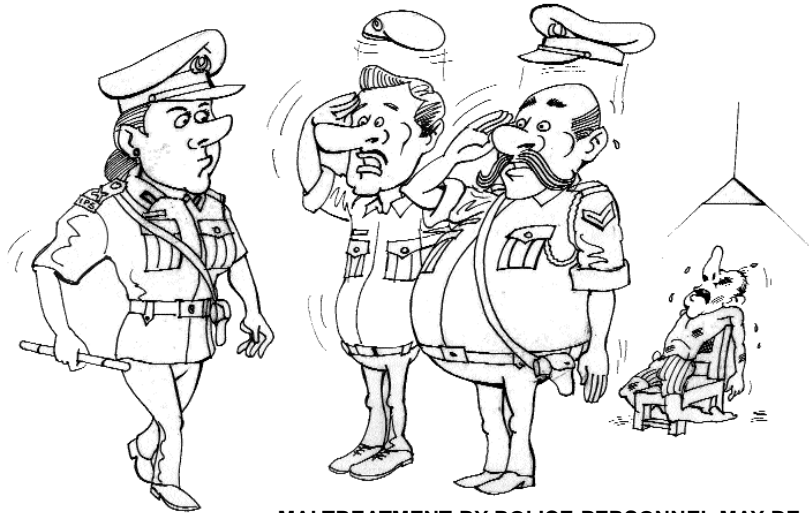
MALTREATMENT BY POLICE PERSONNEL MAY BE REPORTED TO SENIOR OFFICERS

other higher officers like the Deputy Inspector General of Police or the Inspector General of Police. You could even complain to the Superintendent of Police by sending a letter by registered post."