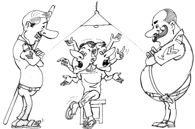
NEVER EXAGGERATE DURING INTERROGATION