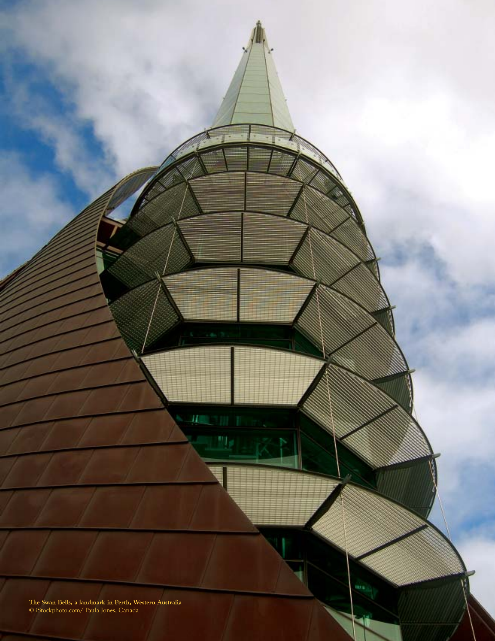
The Swan Bells, a landmark in Perth, Western Australia