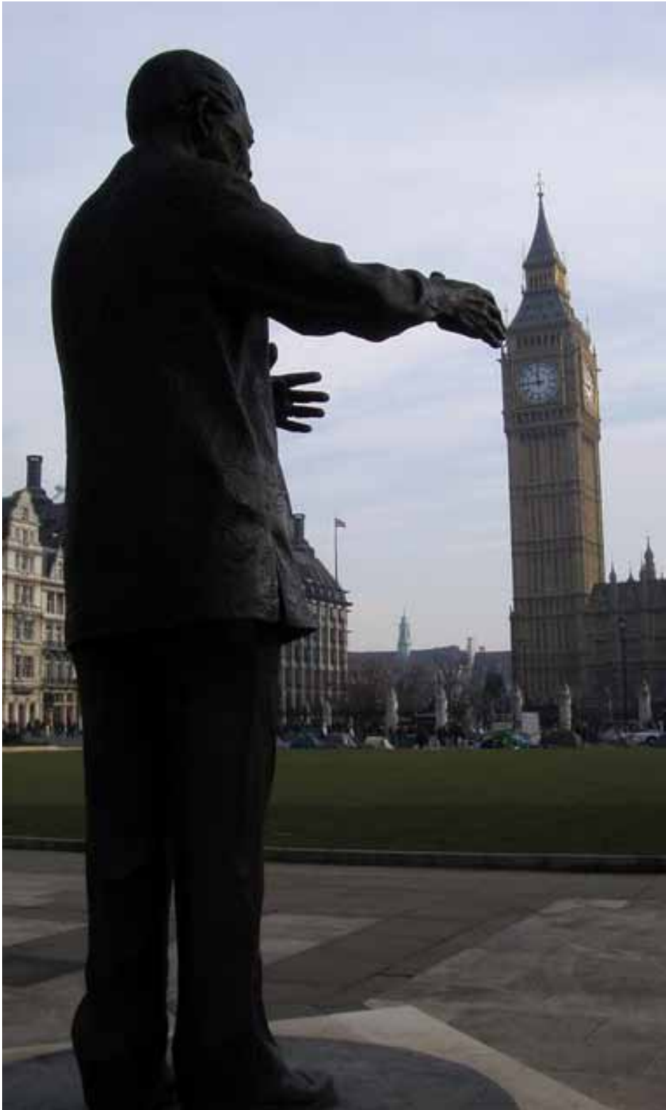
Nelson Mandela Statue in London.