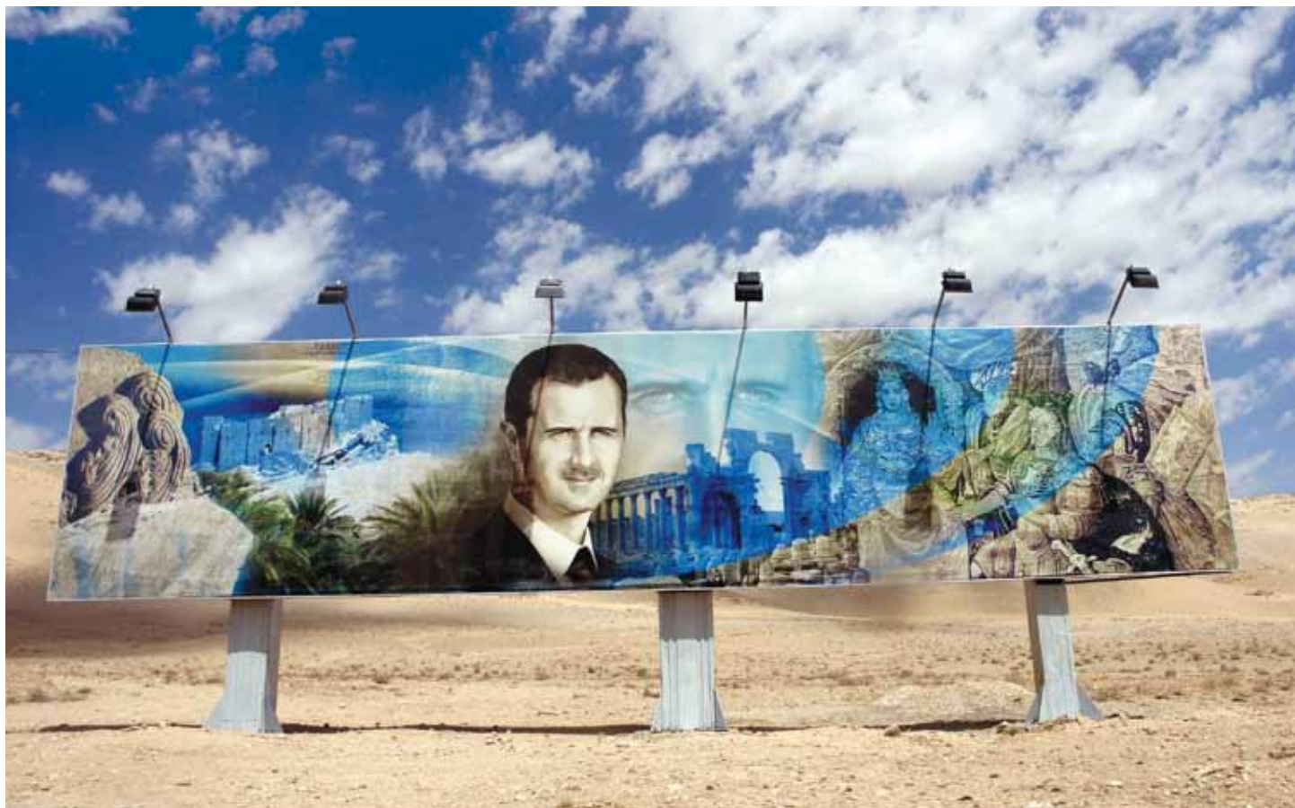
Roadside mural along the Damascus/Aleppo highway representing the current president Bashar al Assad.