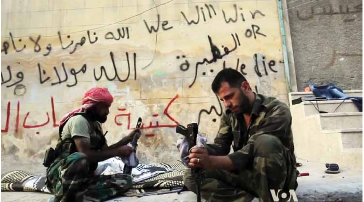
FSA rebels cleaning their AK47s in Aleppo, Syria during the civil war (19 October 2012).