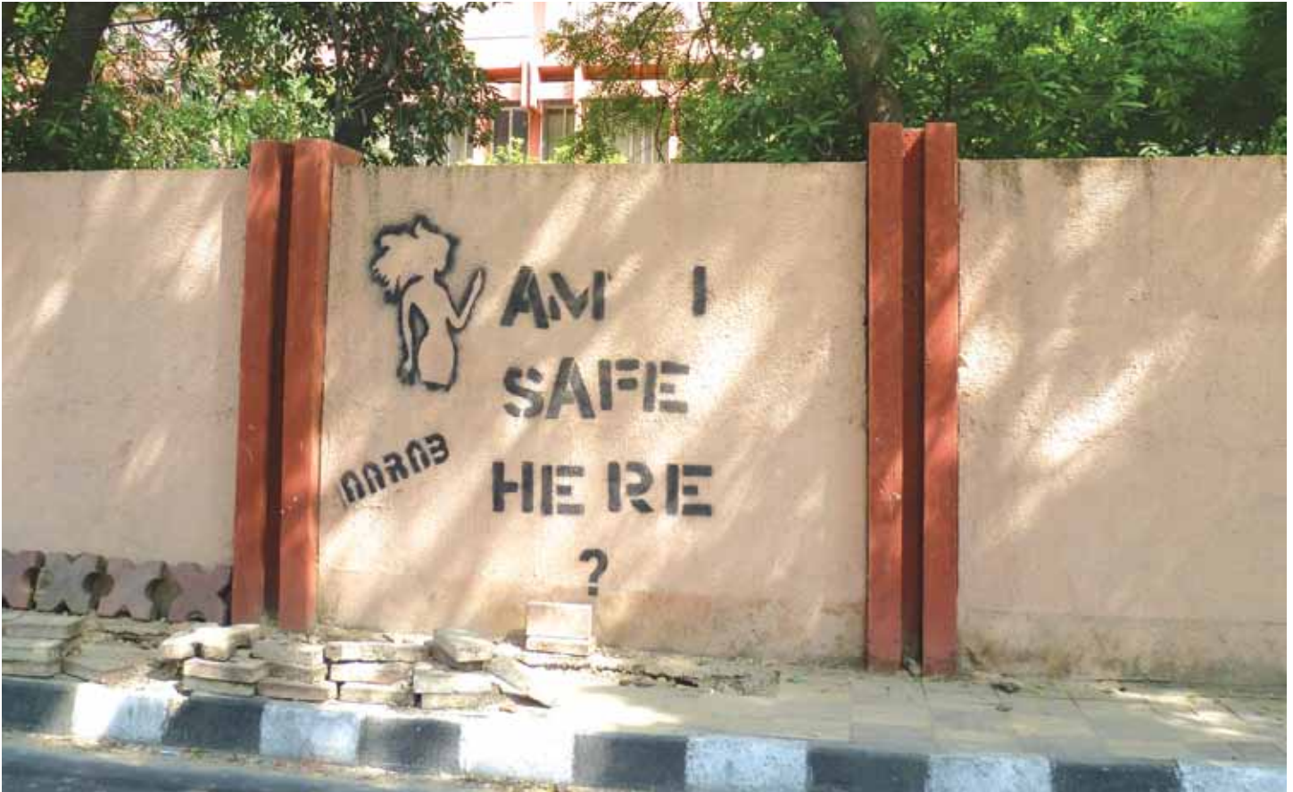
A wall in Delhi, India.

Vrinda Choraria , Commonwealth Human Rights Initiative