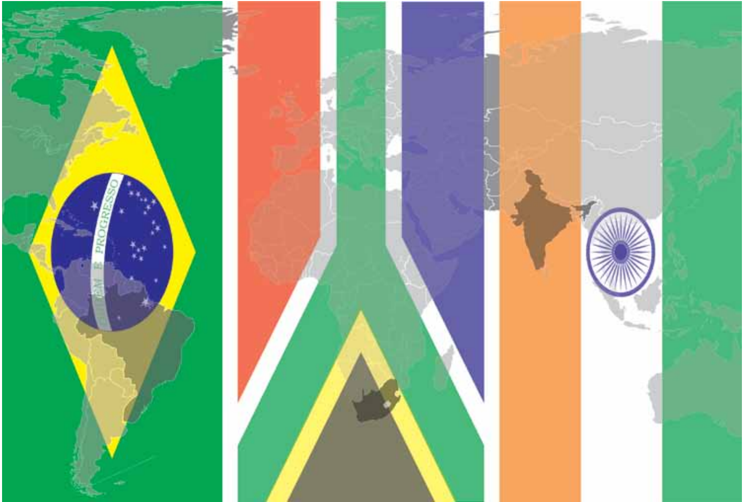
Brazil, South Africa and India are completing the tenth anniversary of the IBSA Dialogue Forum.