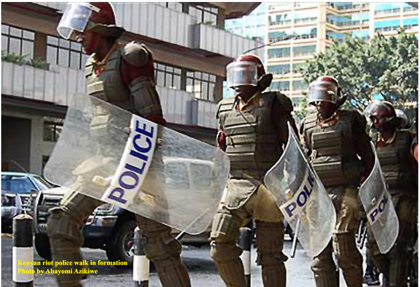
Kenyan riot police walk in formation

The Forum has developed today into a group that has positive, working relationships with stakeholders such as the police, the Police Reforms Implementation Commission, politicians, policymakers and grassroots citizens groups. It is developing a public profile through the media in Kenya, and is involved with the reform process by way of legislative comment and analysis, policy comment and support – as well as commenting on critical developments. In that vein, the Forum saw the need to release a statement to the media in January 2011, following the execution of three suspects by the police in broad daylight in a busy Nairobi street. The statement below, demonstrates that TURF is both a fearless commentator and a constructive partner as the struggle for police reform continues.