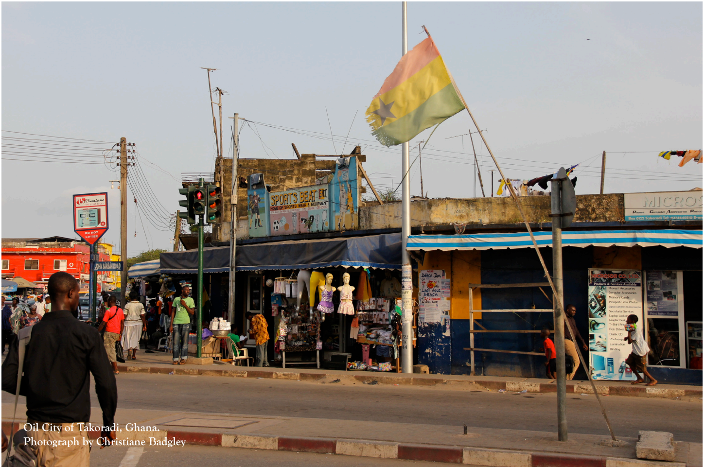
Oil City of Takoradi, Ghana.