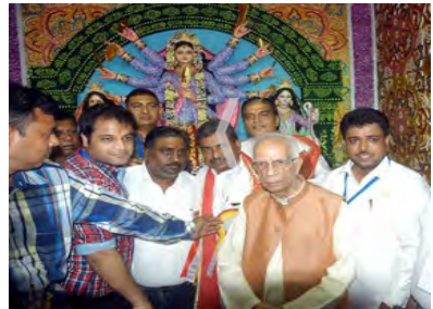
KOLKATA, OCT 19 (UNI):- West Bengal Governor Keshari Nath Tripathi (2nd R) during the inaugurating at a puja pandal at North Kolkata on Monday.