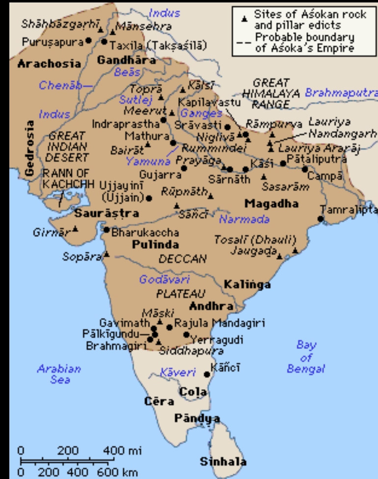
Location of Ashokan inscriptions on the Indian sub-continent

Ensured permanency and regular dissemination