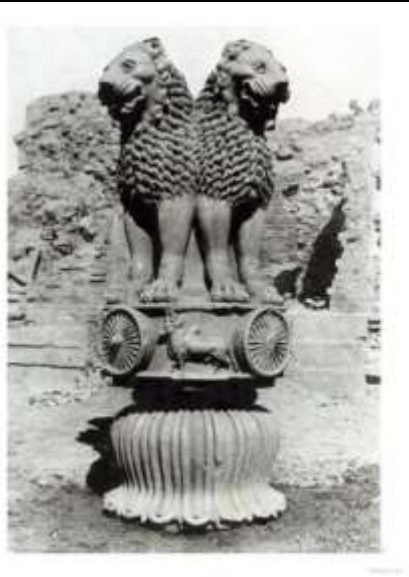
Lion capital of Ashoka's pillar containing his inscriptions, now national emblem of India