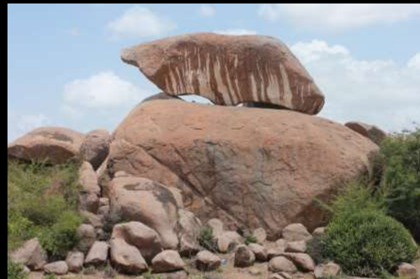
Location of Ashokan inscription at Gavimatha, Karnataka, India