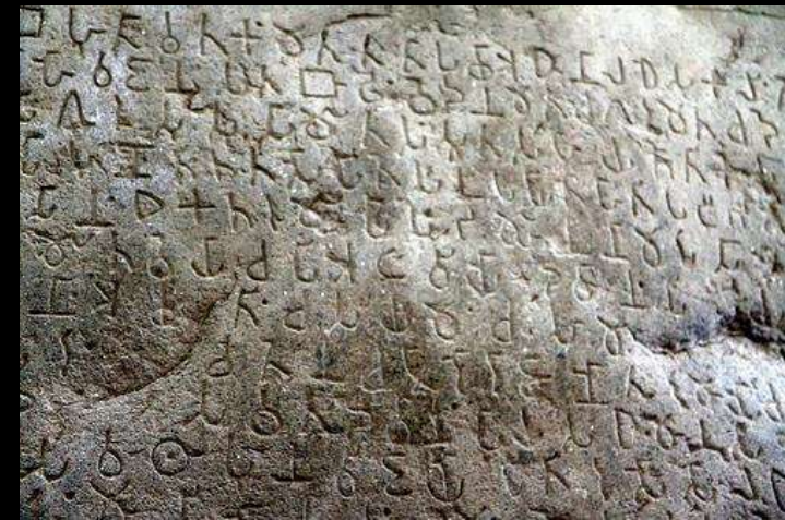
Close up of the Ashokan inscription at Girnar, Gujarat, India